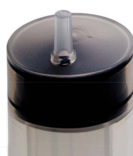
Luer lock tip