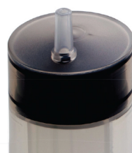
Luer lock tip